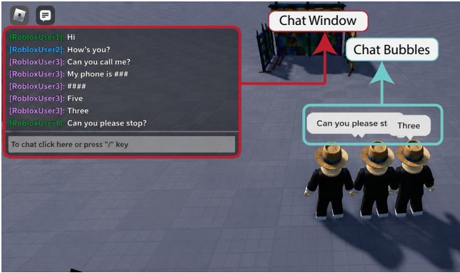
Figure 1: Example of Roblox’s graphical user interface with chat bubbles and chat window with dynamic background (anonymized).