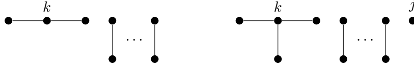
Figure 5.1. Elements of \mathcal{G}_{kk} and \mathcal{G}_{jk}

Theorem 5.2. The following choice of \Phi_{\bullet}^b: \varphi_* F_{\bullet} \rightarrow F_{\bullet} gives a chain map: