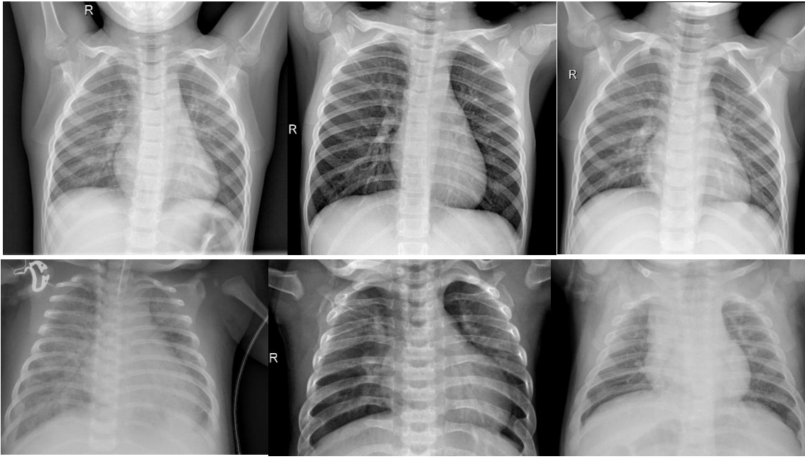
Figure 1 Examples of Pediatric Chest X-ray. Top: Normal, Down: Pneumonia [1]

Researchers in [14] explored the performance of VGG16 and ResNet50 architectures in classifying pediatric chest X-rays and emphasized the importance of dataset balance and augmentation in achieving high sensitivity. Similarly, [15] applied a deep convolutional neural network for pneumonia diagnosis and highlighted the potential of automated systems in reducing diagnostic workload. More recently, [16] used a combination of DenseNet201 and Grad-CAM visualization to not only classify pediatric pneumonia but also provide explainability by highlighting the affected lung regions, aiding clinical interpretability.