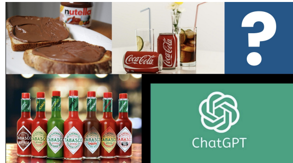
Figure 6: What do these products have in common? The presence of a secret ingredient! Slide in a presentation aimed at high school students. The focus here is on the lack of transparency over the training details of large closed models. Pavia edition 2023/2024. Credits: Matteo Gay, Lorenzo Reina, Anna Vignoli.

We include here some additional pictures of the students' products and presentations as well as some comments from them on the experience of the course itself. These sample testimonials are quotes extracted from the individual reflections that the students had to submit at the end of the course, in addition to the group report.