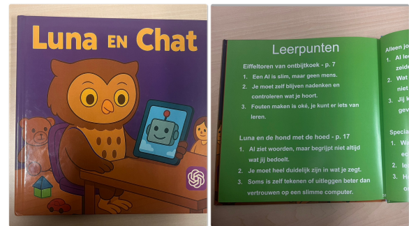
Figure 9: Illustrated book for primary school children, Groningen edition 2024/2025. On the left: book cover; on the right: some explanatory points.

A student in MA Linguistics (Pavia) [originally in Italian, translation is ours]