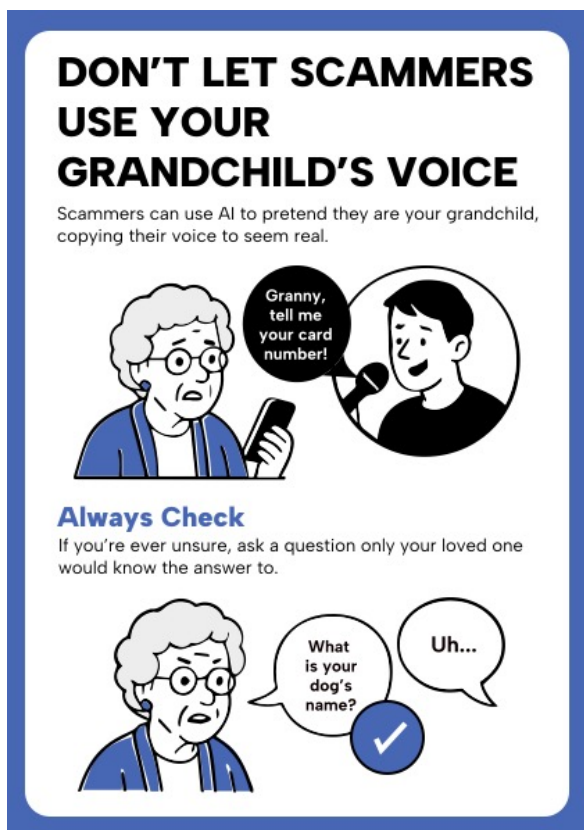
Figure 12: Part of leaflet for elderly people in care homes, Turin edition 2024/2025. Follows explanation in other parts of the leaflet that talk about how state-of-the-art speech technology can now make use of one's voice in a very credible manner. Credits: Elina Saifutdinova, Evgeniya Voropaeva, Kseniia Zakharneva, Tatiana Semenova.