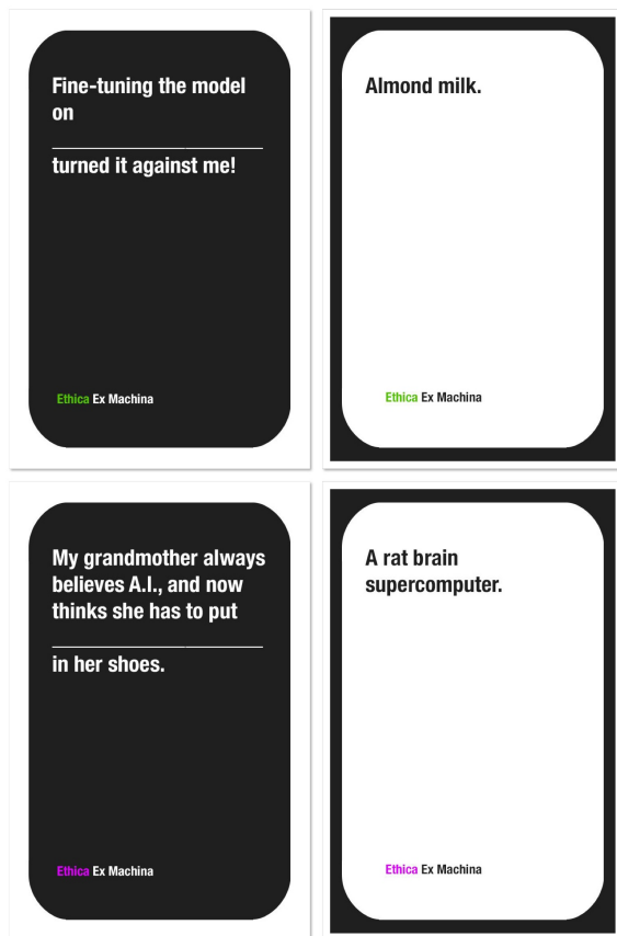
Figure 8: Ethica ex Machina game, Groningen edition 2024/2025. On the right: example prompt cards (in black), on the left: example response cards (in white). The colour at the bottom (violet/green) refers to one of the four topics. Green is Bias, violet is Hype.

"We were thinking more black and white, but it made us really think beyond performance. Performance isn't just accuracy, it relates to the impact tools have on people."