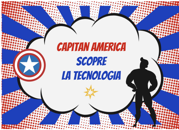
Figure 3: “Captain America discovers technology”. Presentation aimed at primary school kids. Captain America wakes up after 100 years, in Italy, and must face all recent technological developments (without speaking Italian!). Pavia edition 2023/2024. Credits: Vincenzina Cacchione, Giulia Tassi, Aurora Zuin.