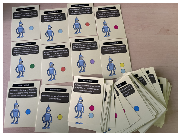
Figure 7: Some example cards from the Debatable game (Groningen, 2024/2025 edition). The coloured dots signal a specific theme.

A student in MA Language Technologies and Digital Humanities (Turin)