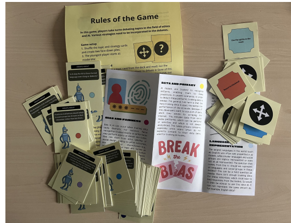
Figure 5: Debatable card game, with instructions and reference leaflet. Groningen edition 2024/2025. Credits: Ilse Kerkhove, Dertje Roggeveen Marieke Schelhaas, Mijke van Daal, Nikki van Gurp.