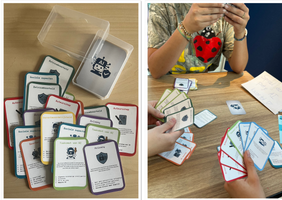
Figure 4: Quartet game, Groningen edition 2024/2025. On the right, the quartet is being used by high school students during an activity at a European Researchers’ Night event, Groningen Forum, September 2025.

year 2024/2025 in Groningen, Turin, and Pavia. One team in Turin got inspired from the activities of the previous year and chose to present at a high school, organising all of the logistics themselves. 19