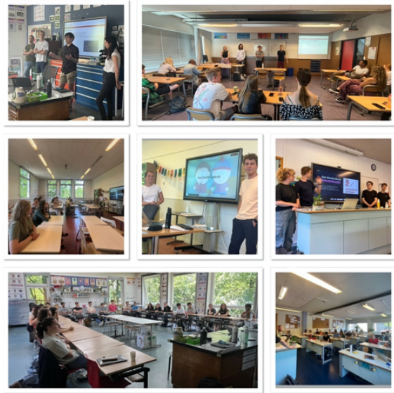
Figure 2: Students presenting in schools in the region, Groningen edition 2022/2023.

wards more responsible research and in particular the creation of an ACL ethics committee, its purpose, and its functioning. On the other hand, it offered them the opportunity to discuss topics with experts other than their two teachers. We wanted students to develop a genuine interest for ethical NLP, and to be free to ask critical questions they had a keen interest in. Intended to foster student’s curiosity and willingness to keep on nurturing the reflections started during the course, this final project was also more suitable given the subjectivity and highly nuanced nature of the topic. Everything we discussed in class was necessarily mediated by our own perspectives. While we tried to provide students with several diversified pointers, it is impossible to escape your own biases and personal perspective. By interacting with experts directly, students could revisit some of the aspects discussed in class, giving more space to their own take, and having access to the opinion of somebody else who is active in the field by means of a very stimulating experience.