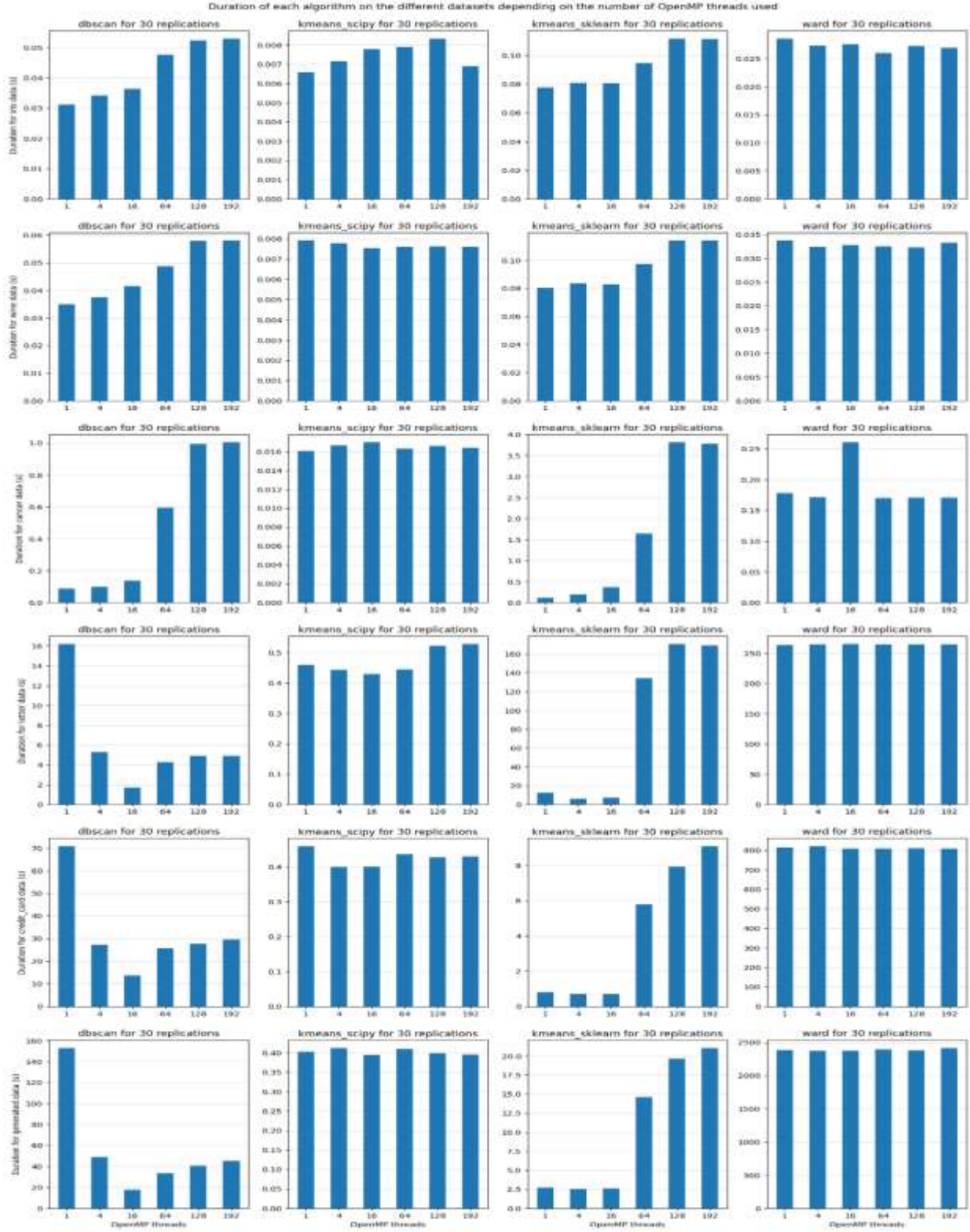
Figure 3: Duration of each algorithm on each dataset depending on the number of OpenMP threads used