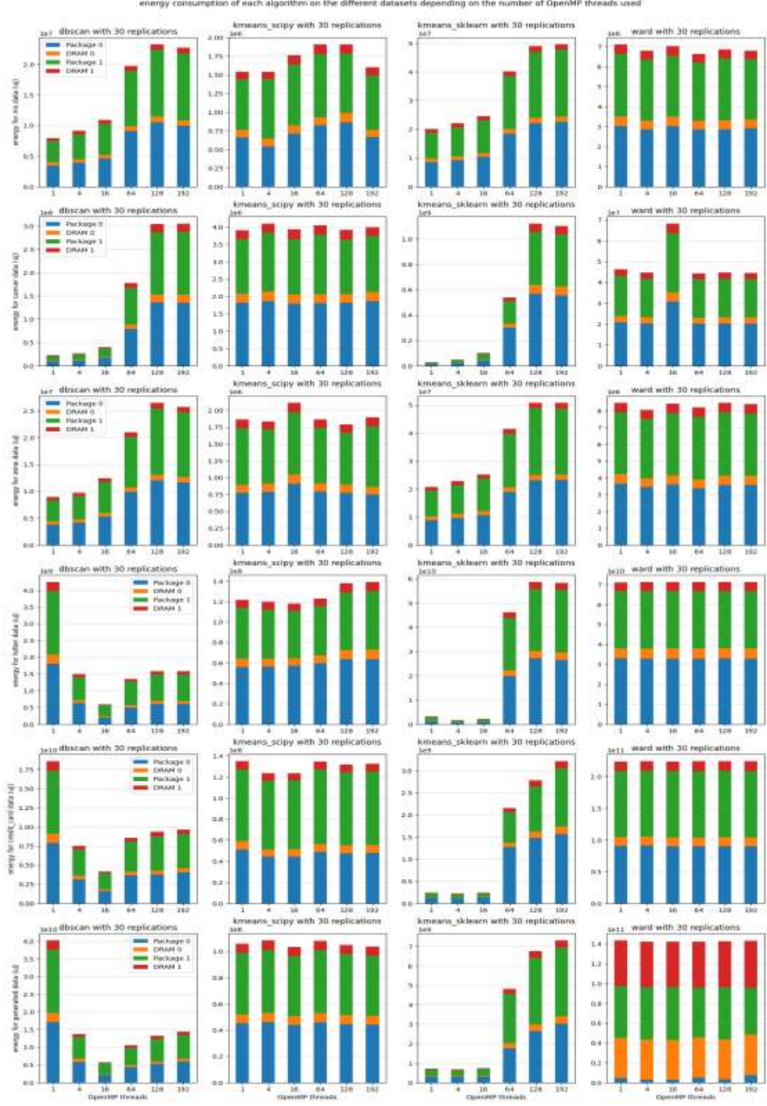
Figure 4: Energy consumption of each algorithm on each dataset depending on the number of OpenMP threads used