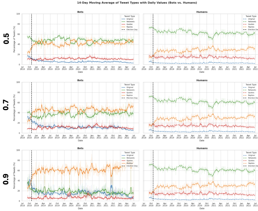
Fig. 1. Fourteen-day moving average sentiment scores for tweets classified as bot- or human-generated, using three BotometerLite thresholds (0.5, 0.7, 0.9) to define bot likelihood. Each panel compares sentiment over time for bots (red) and humans (blue), with shaded lines indicating daily values and solid lines showing smoothed trends. The dashed vertical line denotes the 2018 Brazilian presidential election.

bots to engage in conversational threads, potentially to amplify messages, disrupt dialogue, or insert propaganda. Such behaviour aligns with patterns seen in coordinated influence operations, where bots exploit reply functions to increase visibility and infiltration.