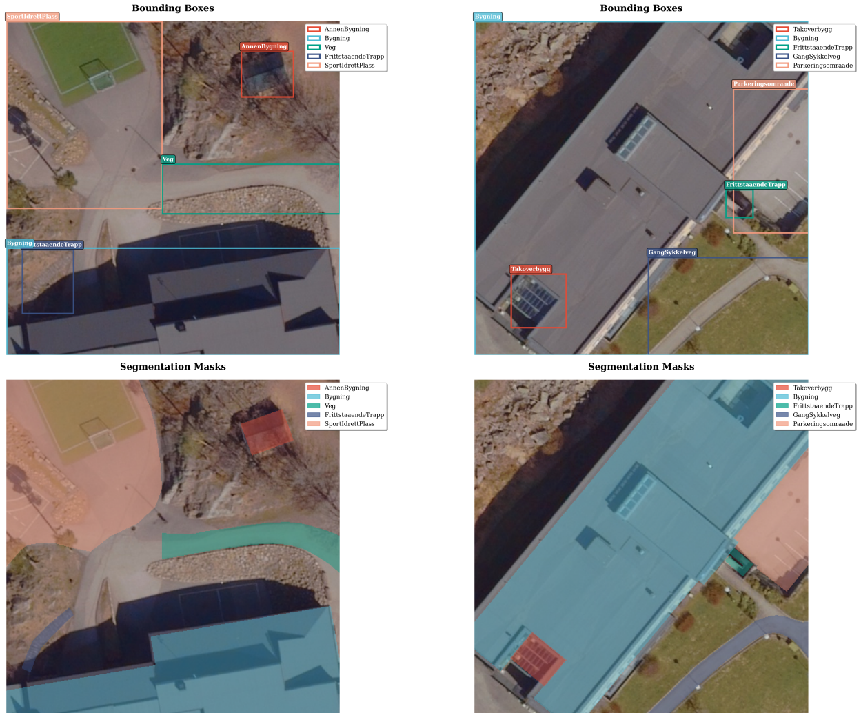
Figure 1: Examples from two locations in the NordFKB dataset. For each location, the top image shows bounding boxes and the bottom image shows the corresponding segmentation mask.

The benchmark includes orthophotos in combination with bounding boxes and segmentation masks for 36 distinct geographic feature classes derived from the FKB database. All dataset components have undergone manual visual quality control to ensure accuracy and consistency. Any detected errors or inconsistencies during this process have been corrected, resulting in a benchmark dataset with a high level of reliability for both research and practical applications.