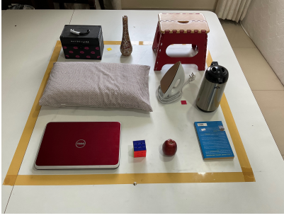
Figure 3: The ten everyday objects used in Tri-Bench.

in which a triangle vertex is completely occluded. These occlusion cases add an extra robustness factor to the dataset.