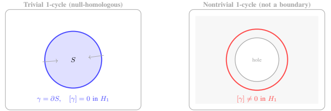
Fig. 1. Dot-Cycle Dichotomy . Left: A cycle that is the boundary of a filled region ( \gamma = \partial S ) is trivial in H_1 : it can be canceled as a boundary when becoming a dot. Right: A cycle encircling a hole is not the boundary of any 2-chain in the space, so it represents a nontrivial class in H_1 . In our framework, nontrivial cycles correspond to high-entropy, short-lived flows ( \Psi ) that collapse under boundary cancellation, whereas trivial cycles correspond to low-entropy content scaffolds ( \Phi ) that persist as memory.

This work was partially supported by NSF IIS-2401748 and BCS-2401398. The author has used Gemini 3.0 and ChatGPT 5.1 models to assist in the development of theoretical ideas and visual illustrations presented in this paper.