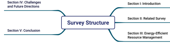
Fig. 2. Survey Structure.

deliver a unified taxonomy from an algorithmic perspective, highlighting the advantages and limitations of existing solutions. Furthermore, by identifying open research challenges and outlining future directions, this work offers a holistic foundation to guide the development of more intelligent, efficient, and sustainable fog/edge computing systems.