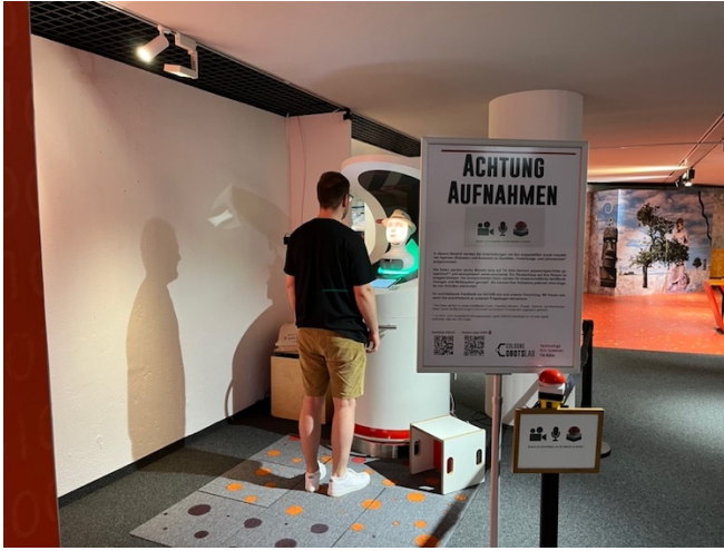
Fig. 1. Experimental setup in the Deutsches Museum Bonn. View from the entrance area to the demarcated interaction area

specializing in the presentation of artificial intelligence. The SIA robot used in this experiment was developed to answer visitors' questions about the exhibition. The robot system was placed near the entrance (see Fig. 1). Visitors could interact with the robotic system within a designated interaction area. During interactions, video, and audio data recordings were made for research purposes, and the system persisted additional interaction data. Visitors must consent to data processing by pressing a red buzzer before entering the robot's interaction area. The robot remains in an idle state until consent is given, and it reminds visitors of the necessary data privacy agreement if consent has not been provided. If the user consented, the user gets detected when entering the interaction area and the robot is in a ready state to have a conversation.