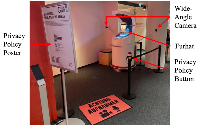
Fig. 1. Setting of the Field Test in the Museum.