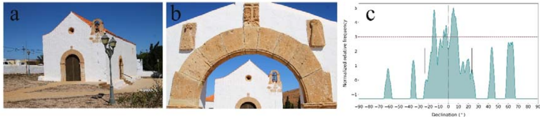
Figure 4. (a) Nuestra Señora de Guadalupe is a typical chapel of Fuerteventura. It has a secondary entrance door open towards the southern sector. (b) The chapel is surrounded by a low wall with a large arched and decorated doorway with small plaques, two of which show 8- and 6-pointed rosettes which could be interpreted as astral symbols, sometimes associated with Venus and the Sun, respectively. (c) Normalized declination curvigram of the churches. The astronomical equinox is marked with a vertical dotted line, whereas the solstices have shorter vertical solid lines. The horizontal dashed line represents the 3\sigma level. Peaks rising above this line can be considered as matter of interest (Muratore et al. 2023).

Muratore et al. (2023) offer three possible explanations to try and justify the peak of -14^\circ in declination, although none of them is conclusive. First, the traditional Canarian celebration of “Los Finaos” (the local version of the Day of the Dead) which takes place on the night of 1 to 2 November each year. Second, a topographic orientation for churches located in a few valleys of the island pointing towards a direction close to the 105^\circ azimuth. Lastly, an unusual but appealing orientation to a “bright star” which might be supported by some relevant ethnographic testimonies.