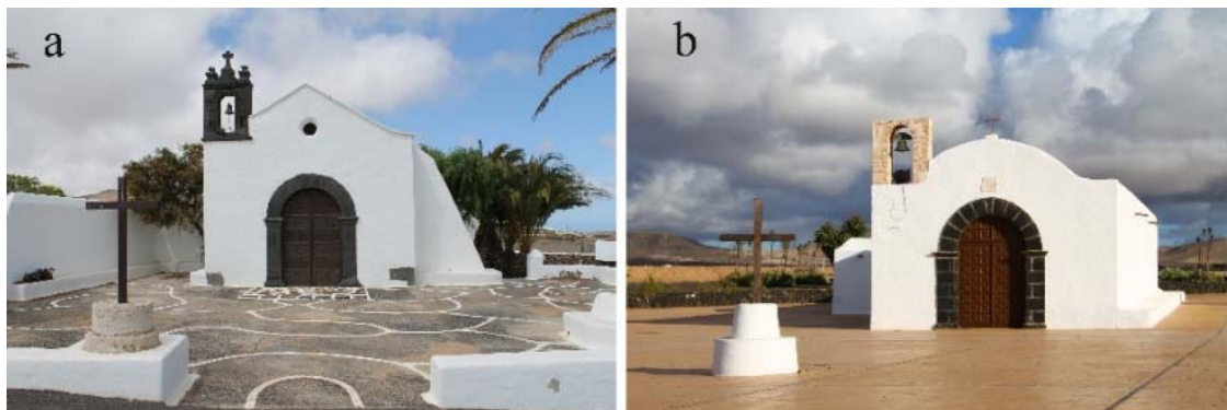
Figure 1. Simple and modest chapels in Lanzarote and Fuerteventura: (a) San Sebastián, in El Mojón, and (b) Nuestra Señora del Buen Viaje, in El Cotillo.

We will now describe the particularities of the different groups of churches -and the orientation patterns that were found for them- in each of the three islands that were surveyed by our team. Then, in the penultimate section, we will present a brief comparative study to emphasize how the difference in the landscape among the islands helped in explaining some of the particular orientations that were found.