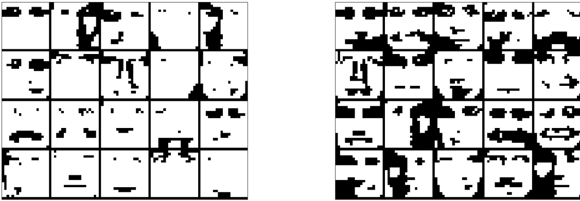
Figure 3: Facial features extracted by AO-BMF (left) and Greedy-TreeBMF (right) on the binarized CBCL dataset.