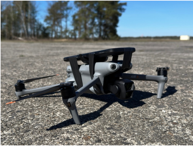
Figure 1 Quadcopter UAV fitted with a Rohde&Schwarz QualiPoc Android network quality testing device.

The UAV was programmed to fly multiple automatic missions with a constant altitude of 11 m and varying speed of 3 m/s, 6 m/s, and 12 m/s, depending on the mission. In each conducted experiment, the UAV followed a constant pre-programmed mission flight path, covering an area of \sim 2 \text{ km}^2 as depicted in the Figure 2.