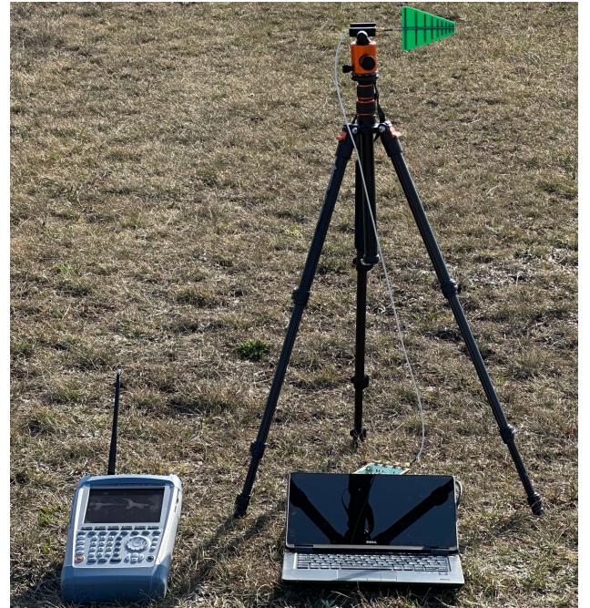
Figure 3 SDR-based jamming hardware with a high-gain directional antenna and Rohde&Schwarz FSH8 spectrum analyzer.

The transmission frequency was configured to target the SSB, in a partial-band jamming mode and PBCH portions of the 5G communication channel in the barrage jamming mode. The jammer transmitted a continuous pseudo-noise signal spanning a bandwidth between 10–40 MHz and transmission power between 20–30 dBm, depending on the targeted portion of the spectrum. To ensure the jammer was working correctly, during each experiment we recorded a spectrogram of the communication channel using a Rohde&Schwarz FSH8 spectrum analyzer.