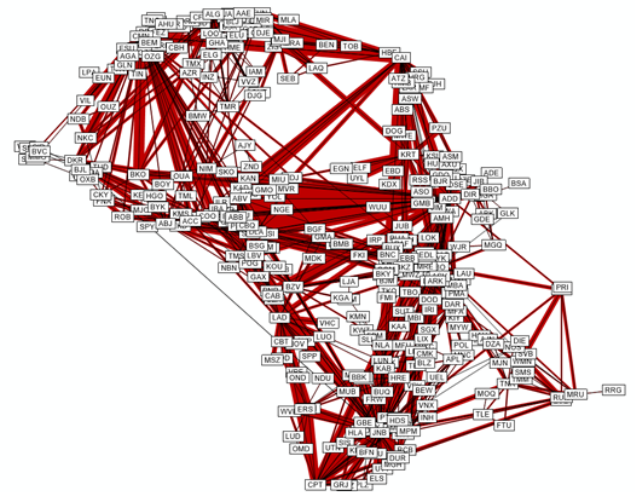
Figure 1: Capacity-supply in terms of seats offered between O-D pairs within Africa during one week in November 2016.

The primary database includes codeshare flights. Codeshare flights have become a competitive feature in the industry, offering more flight options. This availability generally helps passengers by simplifying the booking process and enhancing