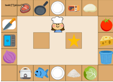
(a) Overcooked Plus