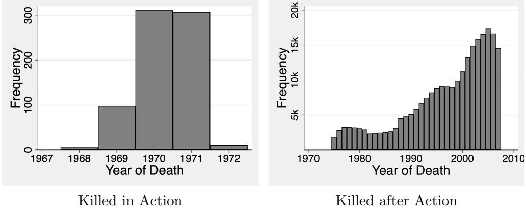
FIGURE 2. DISTRIBUTION OF DEATHS FOR THE 1950 COHORT IN THE TWO DATASETS.

Note: The left panel displays the distribution of combat-related deaths for the 1950 birth cohort using the Combat Area Casualties Dataset, restricted to Black and white Selective Service members who died before 1975. The right panel shows the distribution of deaths for the same 1950 cohort as recorded in the BUNMD data (1975–2007), including all Black and white individuals, regardless of gender, who died during this period.