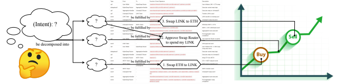
Figure 1: User’s intent on spot trading for profit. Even though it represents one of the simplest and most common intentions, it still requires analyzing the on-chain data behind three related transactions, summarizing the corresponding semantics, and incorporating external market price data in order to understand the purpose of each transaction and thereby infer the underlying intent.

The current DeFi ecosystem still faces many challenges, including but not limited to difficulties in matching NFT trading demand