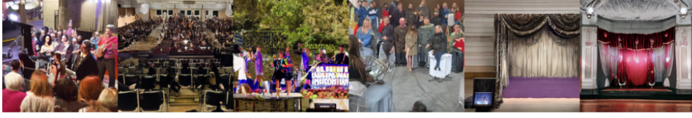
(a) Sample synthetic images of class "stage"