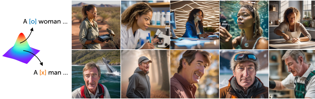
Figure 1. Contrastive Concept Instantiation (CoCoIns) is a generation framework that achieves subject consistency across multiple independent generations without fine-tuning or reference images. Unlike prior work that requires customization fine-tuning, adopts an additional encoder for references, or generates images in batches, CoCoIns creates instances of concepts with unique associations connecting latent codes to subject instances. Given a latent code (o/x), CoCoIns converts it into a pseudo-word ([o]/[x]) that determines the appearance of a subject concept. By reusing the same code, users can consistently generate the same subject instances across generations.

Reviewed on OpenReview: https://openreview.net/forum?id=fPZ7DNlOSn