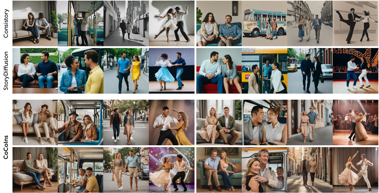
Figure 12. More examples and comparison with previous work of multi-subject consistency.