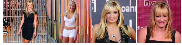
Figure 5. Results of training the mapping network as a noise prediction problem. The network overfits to the dataset and generates low-quality images.

In this work, we propose Contrastive Concept Instantiation (CoCoIns), the first approach to achieve subject consistency without the need for time-consuming fine-tuning and labor-intensive reference collection. Our key idea is to model concept instances in a latent space and train a mapping network using contrastive learning to associate latent codes with output concept instances. We demonstrate its efficacy on single-subject human faces and extend it to multi-subject scenarios and general concepts. We believe this work establishes a foundation for controllable content creation.