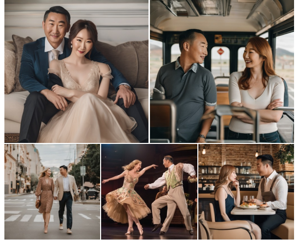
Figure 7. Results of multi-subject consistency. Given two different latent codes, the model trained on single-subject images can maintain consistency for multiple subjects.