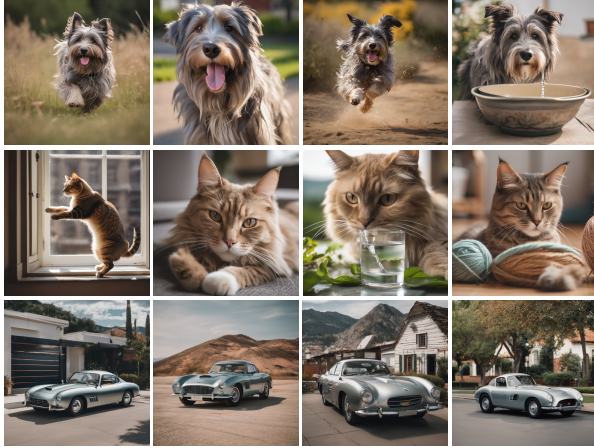
Figure 6. Results of general concept consistency. Our approach makes no assumptions about object categories. It can potentially be applied to other concepts such as cats, dogs, and cars.