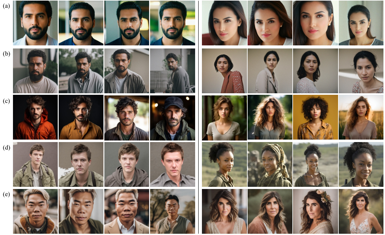
Figure 3. Qualitative comparisons on Portraits from (a) StoryDiffusion (Zhou et al., 2024), (b) Consistency (Tewari et al., 2024), (c) IPrompt1Story (Liu et al., 2025), (d) DreamBooth (Ruiz et al., 2022), and (e) CoCoIns. The left four columns are generated with a man as the subject, and the right four with a woman. We achieve subject consistency without generating images in batches or performing reference fine-tuning.

Negative Distance Weight Schedule. We empirically find that the distance between anchor and negative samples is often too large at the beginning of training. The model tends to ignore the randomly initialized input latent codes and produces identical outputs. Therefore, we implement the weight of negative distance \lambda_{\text{neg}} = \gamma(k/K)^\beta as an increasing function over training steps, where k and K are the current and total training steps, and \gamma and \beta are hyperparameters.