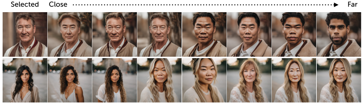
Figure 9. Results generated with neighbors of a pseudo-word. We generate 100 images with randomly sampled latent codes and a fixed initial noise. Given a randomly selected code and its corresponding image, we find the neighbors of the selected code by sorting the cosine similarity between the pseudo-word transformed from the code and the others. The result shows that the pseudo-words of closer neighbors ( i.e. high cosine similarity) produce more similar faces.

Additionally, as discussed in Section 4.1, the weighting of negative distances is implemented as an increasing schedule parameterized by \gamma(k/K)^\beta , where k is the current training step, and K is the total number of training steps. \gamma and \beta are hyperparameters. We also examine the effect of varying these two hyperparameters.