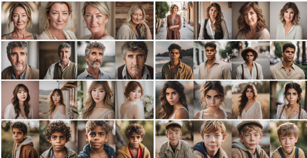
Figure 10. Eight sets of examples from Portraits . The subjects for each row are woman, man, girl, and boy.

transition between them. Using a fixed initial noise results in similar background appearances across the interpolated images.