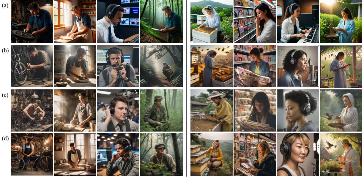
Figure 4. Qualitative comparisons on Scenes from (a) StoryDiffusion Zhou et al. (2024), (b) Consistory Tewel et al. (2024), (c) DreamBooth Ruiz et al. (2022), and (d) CoCoIns. 1Prompt1Story Liu et al. (2025) is absent because it requires a specific prompt format with unified subject descriptions. The left and right four columns show two different subjects in diverse contexts. The prompts can be found in Section D.