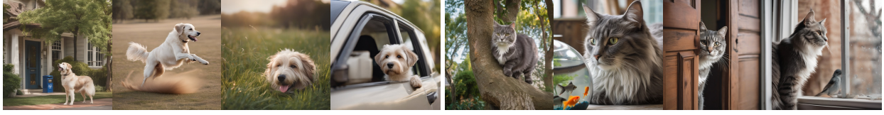
Figure 13. Two sets of examples demonstrating consistency for general concepts.