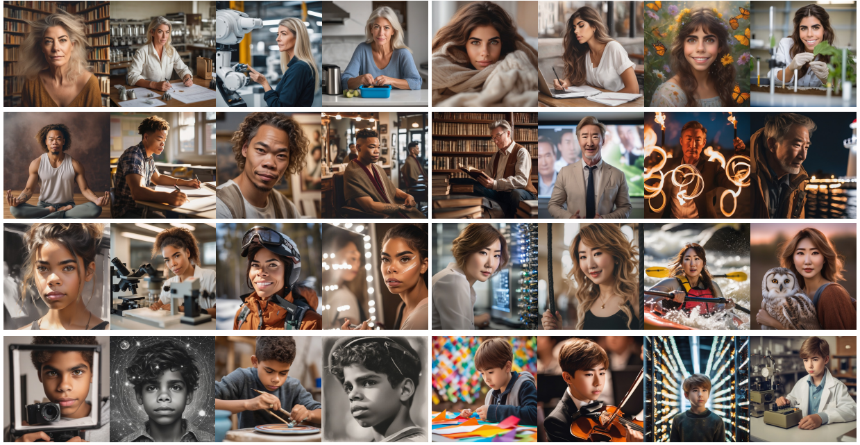
Figure 11. Eight sets of examples from Scenes . The subjects for each row are woman, man, girl, and boy.